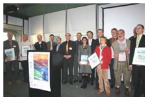
NETS AWARD winners